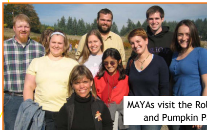
MAYAs visit the Roloff Farm and Pumpkin Patch.

avenues brought our young adults regular updates about what was happening. To accommodate our members' scattered location, we be-