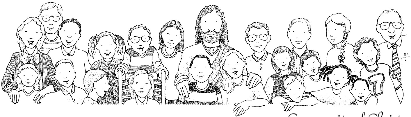
Community of Christ

Draw the world or your church. The "Community of Christ" is a world community. What can the church do for the world?