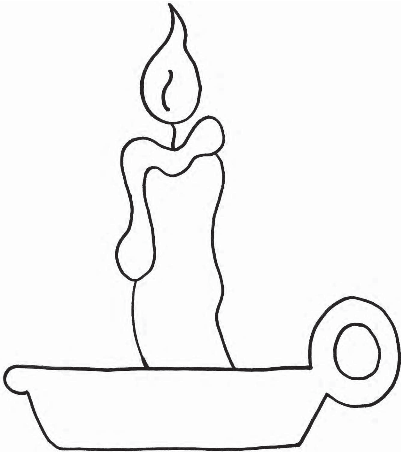
This Lighted Candle